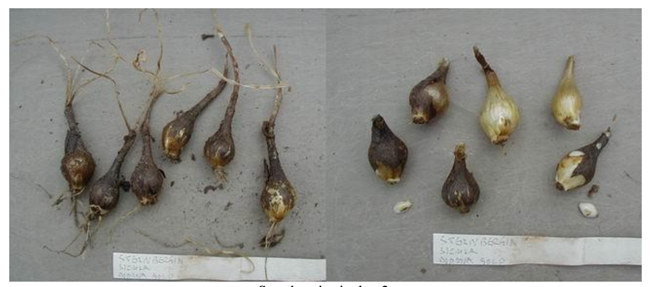
Sternbergia sicula x2.

A typical tuber illustrates not only how some tubers grow but also shows the effect of adjusting the levels of a picture in the computer. On the left is the picture from the camera and on the right with auto levels applied. The changes you can make are limitless and some very bizarre effects can be achieved.